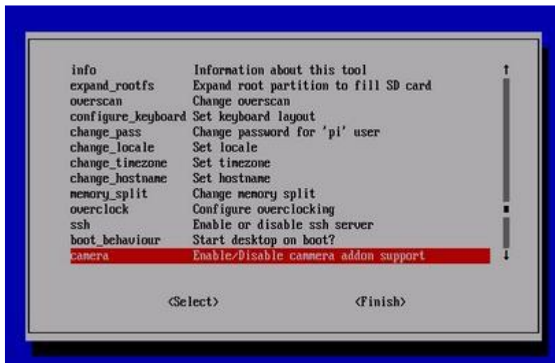
Figure 2: Enable camera